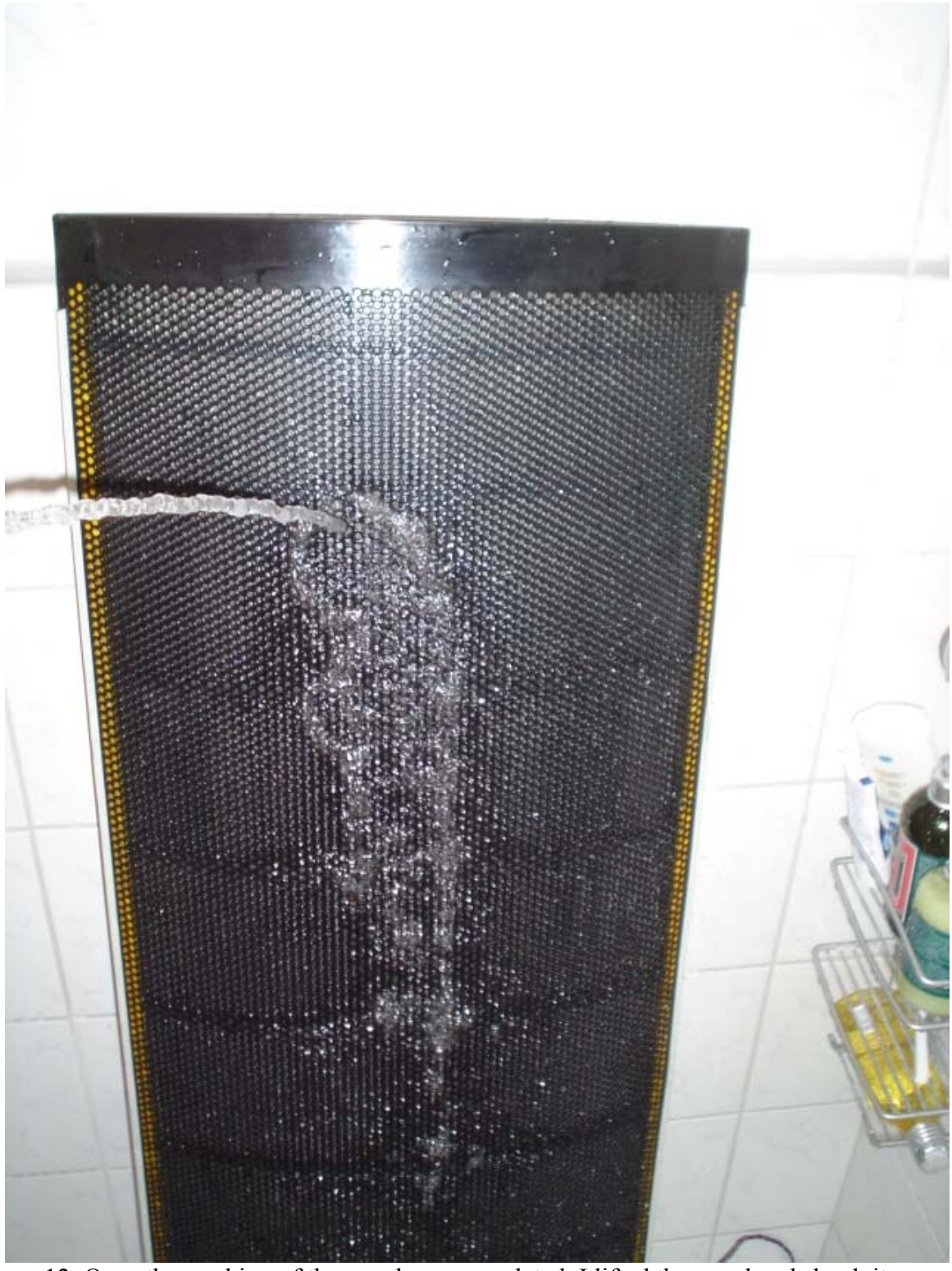
12. Once the washing of the panel was completed, I lifted the panel and shook it up and down, a lot of the water inside the Stator will come out.